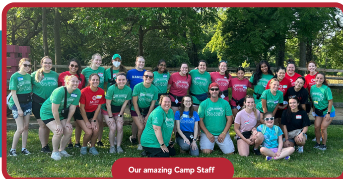
Our amazing Camp Staff