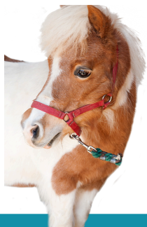
In memory of Dreamer

For 20 years, The Barn has endured many challenges and setbacks, but hope, endurance and resiliency are qualities on which we pride ourselves. These characteristics are also found in children we serve as they find strength to overcome obstacles each and every day. The Barn was designed to provide children with a handicapped-accessible facility so those who might otherwise not be able to enjoy farm experiences and animal care would be able to do so. The goal of our programs is to promote confidence, improve self-esteem, and support leadership qualities in children with disabilities. The response of the children who have participated up to this point has been overwhelmingly positive. The Barn offers unique experiences that bring out amazing change in the children who spend time here.