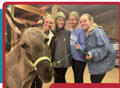
Some of our Volunteers We couldn't be here without you!